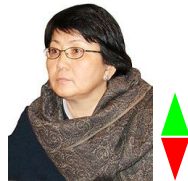
Roza Otounbaieva New Kirghistan PM First female heading a Coup d'Etat