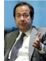
John Paulson President Paulson & Co. Beneficent of Goldman's tricks