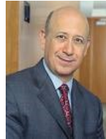
Lloyd Blankfein Goldman Sachs CEO Played customers against each others