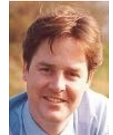
Nick Clegg UK Lib Dem The third man and his party are moving up