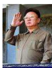
Kim Jung Il

Back-to-back winner of the Indian election