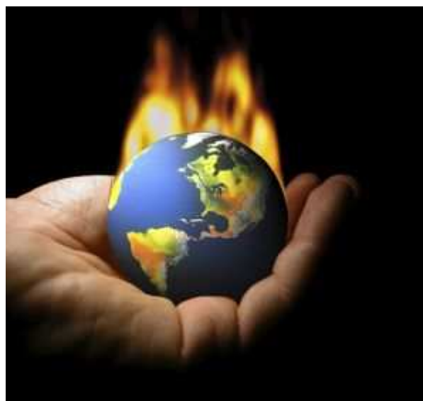
Planet heating: The world in 2009 will be smaller than it was in 2008. So might be most portfolios and companies assets.

It's difficult for the average citizen/investor to assess the size of the global collapse. Big drop, huge losses, Madoff, UBS, Stanford, there are plenty of words to describe the crisis, but how do we evaluate it? You can look at it different ways: (1) your own portfolio, if it is down by about 30%-40%, you are in line, less, you are a winner, more... bad luck; (2) the drop in number and size of billionaires, especially the "new riches", only one Russian and one Indian left... and Bill (Gates) is back on top; (3) this number that was mentioned by an eminent economist: the world's capitalization has dropped by the equivalent of 50% of the global GDP. This is a big percentage!