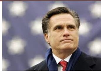
Mitt Romney First winner in Republican race