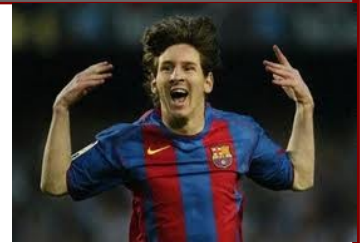
Lionel Messi Player of the year, decade?