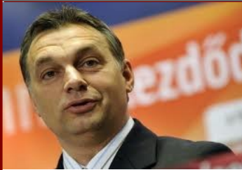
Viktor Orbán Hungarian PM