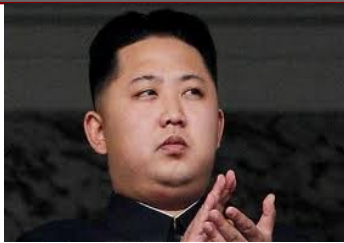
Kim Jung-un New North Korean Dictator